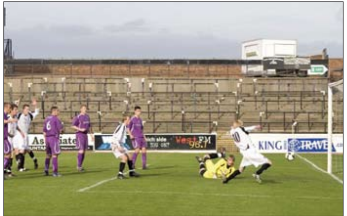
Youth Development Team in Action