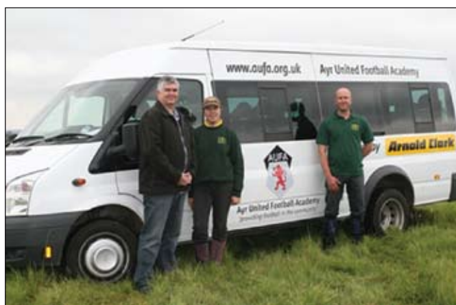
Burnockmill Equestrian Centre and Arnold Clark donate mini-bus